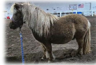
Pony is 16-years-old and joined Mounted Eagles in Spring of 2025.

Leo and Pony are best buddies and are anxious to become great friends with their reading partners.