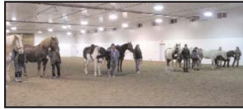
The Mounted Eagles' Equine Family is introduced at a Volunteer Training Session